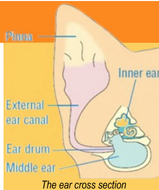
The ear cross section